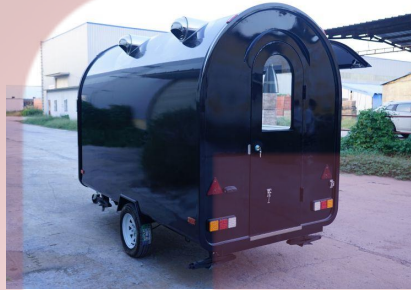
- Side -