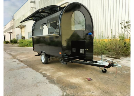
- Side -