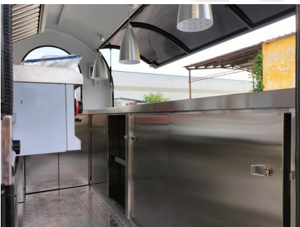
- Inside -