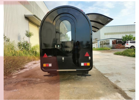
- Door -