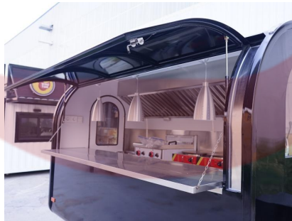
- Window -