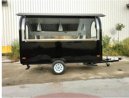
- Front -