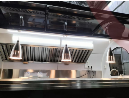
- Lights -