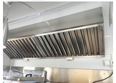
- Exhaust Hood -