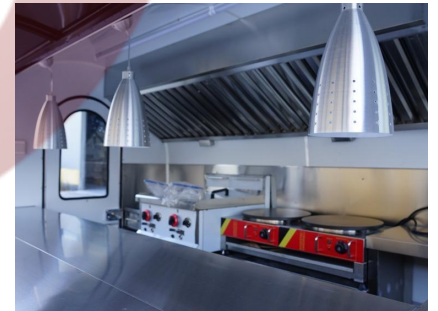
- Inside -