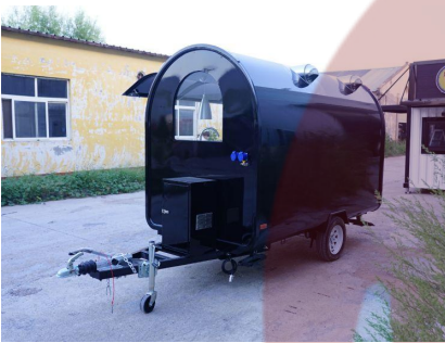
- Rear -