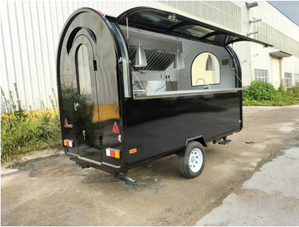
- Side -