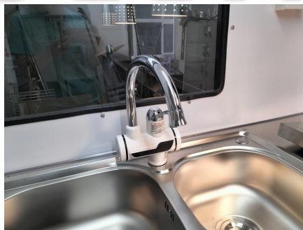
- Sinks -